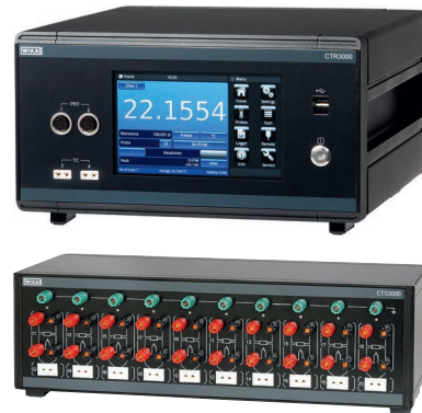
Precision thermometer model CTR3000 with multiplexer model CTS3000

To achieve the best possible performance of the precision thermometers, the coefficients/characterisation of the temperature probe have to be calculated and stored in the measuring instrument channel being used (or if using SMART probes into the probe connector).