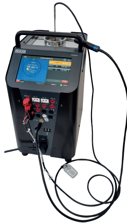
CTD9350 as an application with an external reference thermometer

As gradients over the first 40 mm [12.58 in] above the bottom provide the largest contribution to the measurement uncertainty, these are therefore also specified in the data sheets.