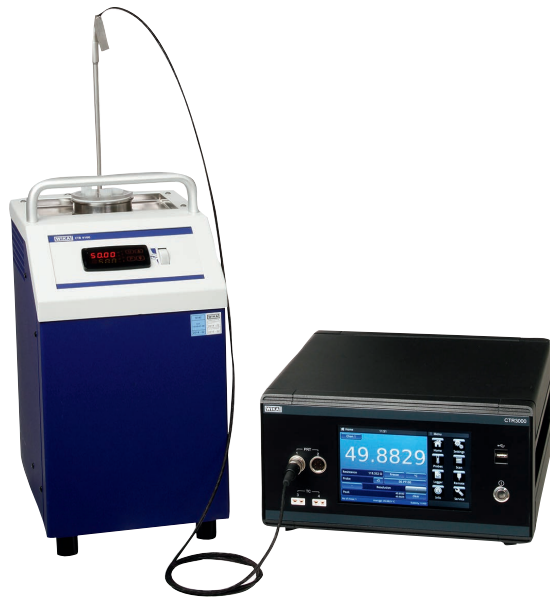
Temperature dry-well calibrator model CTD9100 with precision thermometer model CTR3000