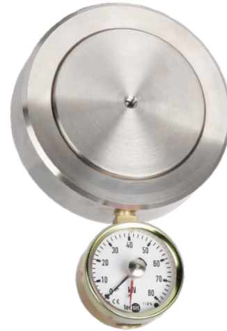
Hydraulic compression force transducer, model F1135